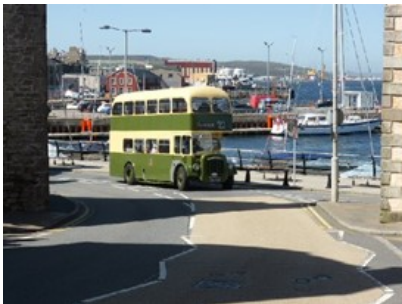
Daimler 325 leaving the Esplanade and is about to start the climb up Church Road.

The show was held at Clickimin Leisure Centre where there was an impressive collection of all sorts of vehicles, with a total of 821 displays over the two-day gathering. The interest in our buses was rewarding, as people clearly appreciated the work that had gone in to restoring the vehicles. The Daimler was used to the joy of its passengers on a Park & Ride, with the National being used on drive's to various locations on the island. Thankfully, the journey home was more pleasant, with calmer seas and a wonderful views of a sunset on Shetland.