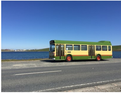
Leyland National KSO 74P with the Sullom Voe Terminal in the background.

During the Bon-Accord Steam Fair at Castle Fraser in 2015, a group from Shetland, who had brought a vintage Austin to the Fair, asked us to consider attending an event in Shetland in June 2016. Both trusts, Aberdeen & District and FirstGroup Heritage, agreed it was something that they would support. We set sail from Aberdeen on the "North Boat" with our precious cargo of Leyland National KSO 74P and Daimler CRG 325C and were faced with some choppy seas on the journey to Shetland.