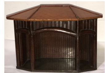
Model Tramway Shelter